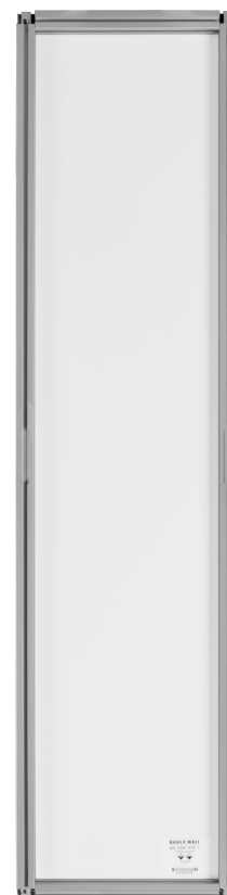
1' x 4' PANEL SW-CON-P1B-8 (back)