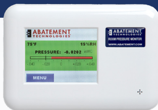
PART NO: RPM-RT1 OR RPM-RT2