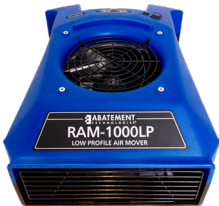
PART NO: RAM1000LP