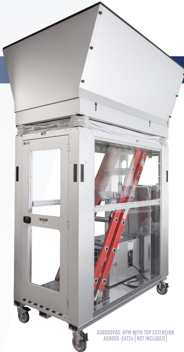
AG8000PAS-RPM WITH TOP EXTENSION AG8000-EXT24 (NOT INCLUDED)