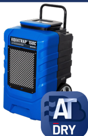
PART NO: AT150C