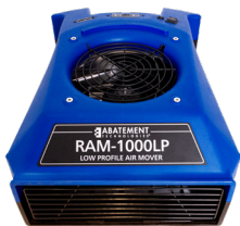
PART NO: RAM1000LP