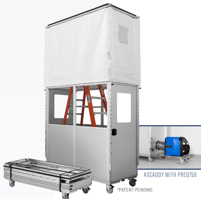
AGCADDY WITH PRED750