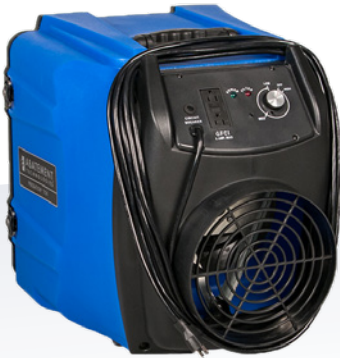
PART NO: PRED750