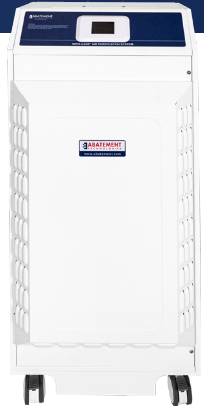
HC800FD PORTABLE AIR PURIFICATION SYSTEM

Most of the Abatement Technologies electric-powered products in this brochure are available in 230 volt/50 hertz and 230 volt/60 hertz models for overseas customers. Contact our Healthcare Export Sales Department for more information.