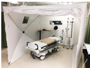
PART NO: IQ810