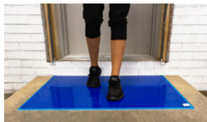
STICKY FLOOR MATS