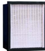
AIR SCRUBBER FILTERS