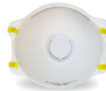
DISPOSABLE DUST MASKS