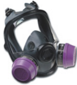
RESPIRATORS AND FILTERS