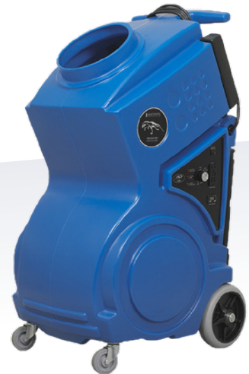
PART NO: PRED1200 / PAS1200UV