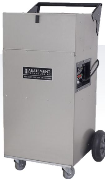
PART NO: PAS1200 / PAS1200UV