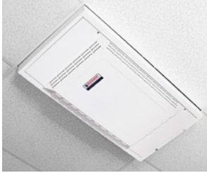
PART NO: HC800CD

The HC800CD is similarly equipped to the HC800FD. It can typically maintain 12+ ACH in rooms as large as 3,625 to 4,250 cubic feet, depending on the installation.