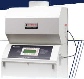
PART NO: UV800F

The UV800F is designed specifically for use with the HEPA-CARE® HC500FD and HC800FD portable units, mounting onto the top exhaust outlet. Air flowing through the UV800F is irradiated with germicidal UV (UV-C) energy.