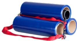
GRILL MASK AND DISPENSERS