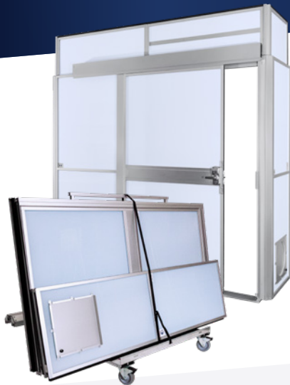
Optional transport cart is available to purchase

ANTEROOM KITS - Customize an AIRE GUARDIAN® SHIELD Anteroom to meet your patient isolation requirements and meet ICRA Guidelines for temporary containment barrier walls.