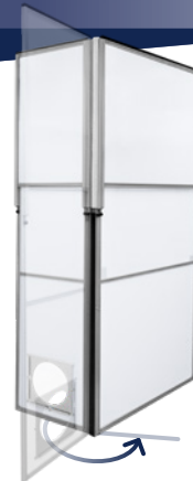
Universal Hinged Corners

The fixed inside corner changes the wall path 90°.