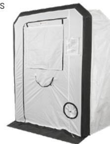
PART NO: HC7917