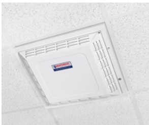
PART NO: HC500CD

This compact model is designed for areas that don't require as much airflow as the HC800 series. It can typically maintain 12+ ACH in rooms 2,250 to 2,750 cubic feet, depending on the installation.