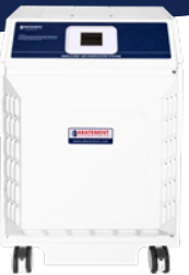
PART NO: HC500FD / HC500FDUV

This compact model is designed for areas that don't require as much airflow as the HC800FD. It can typically maintain 12+ ACH in rooms 2,250 to 2,375 cubic feet, depending on the installation.