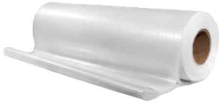
POLY SHEETING, CLEAR, RIP-PROOF, FIRE RETARDANT