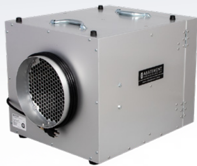
PART NO: PAS750