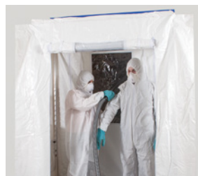
PART NO: AG3100TMK