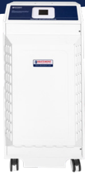
PART NO: HC800FD / HC800FDUV

The HC800FD is the “premier standard” of portable systems, with top-of-the-line performance and features, and unmatched reliability. It can typically maintain 12+ ACH in rooms 4,000 to 4,625 cubic feet, depending on the installation.