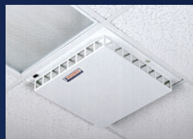
PART NO: UV400C-PT & UV400C

The UV400C-PT is designed specifically for irradiating exhaust air from any model. The UV400C is a module that can also be used in place of standard return-air grills in high infection risk areas.