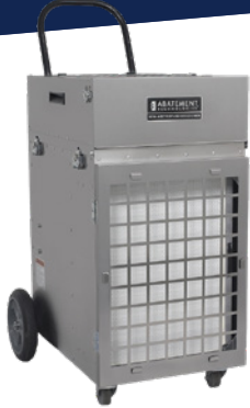
PART NO: PAS2400