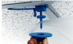
POLY HANGERS AND GRABBERS