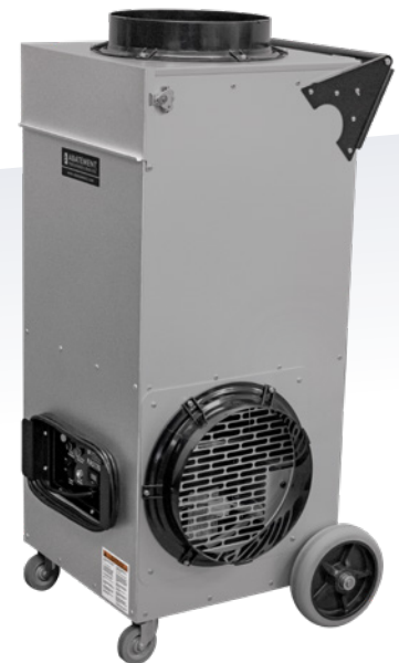
PART NO: PAS1700