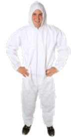
DISPOSABLE PROTECTIVE CLOTHING