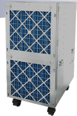
PART NO: PAS5000