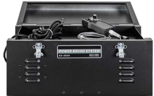
K3-2024 Power Unit (Includes K3-2023 Remote)