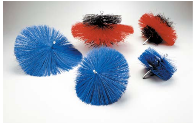
K3-2090 Brush Set