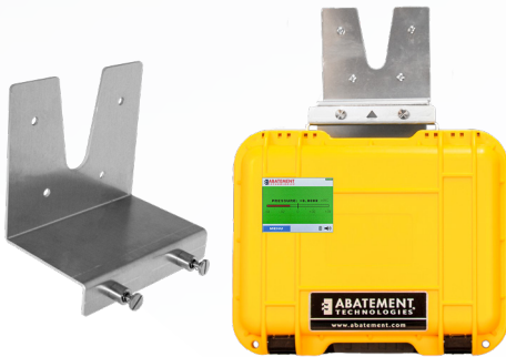
Wall Hanger attaches to the rear of the PPM3-S case for secure wall mounting. P/N: RPM-HANG, sold separately.