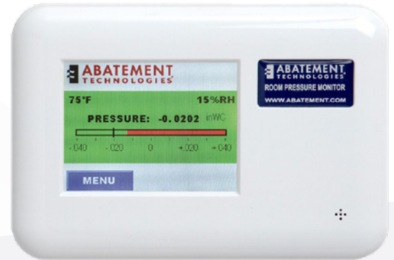
PRM-RT Series Monitor

Specifications and details are subject to change without prior notice.