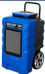
PART NO: AT150C