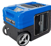
PART NO: AT200C