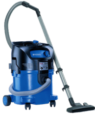
PART NO: V8000WD