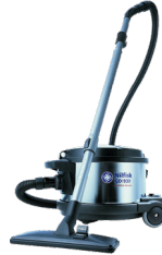
PART NO: G0930