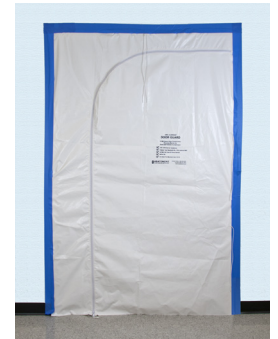
PART NO: AG-DG100