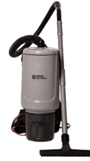
PART NO: G010