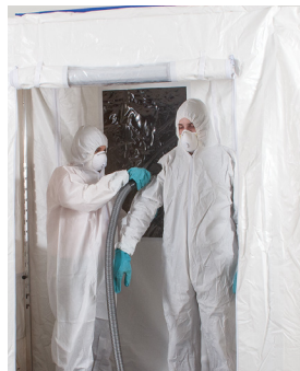
PART NO: AG3100TMK