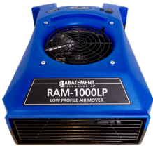
PART NO: RAM1000LP