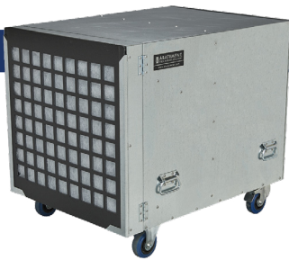
PART NO: H2KM & H2KMA