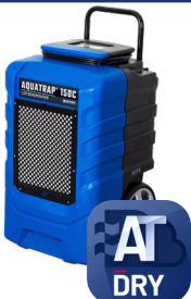
PART NO: AT150C