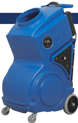
PART NO: PRED1200 / PRED1200UV