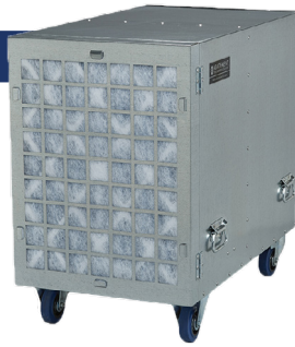
PART NO: H1990M