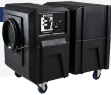
PART NO: BD2KM & BD2KMA