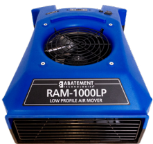
PART NO: RAM1000LP