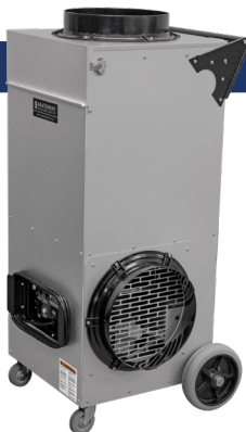
PART NO: PAS1700