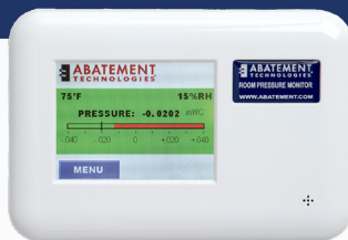
PART NO: RPM-RT1 OR RPM-RT2