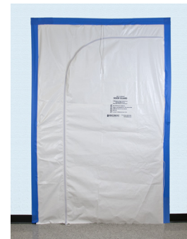
PART NO: AG-DG100