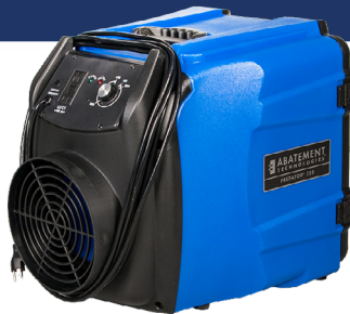
PART NO: PRED750