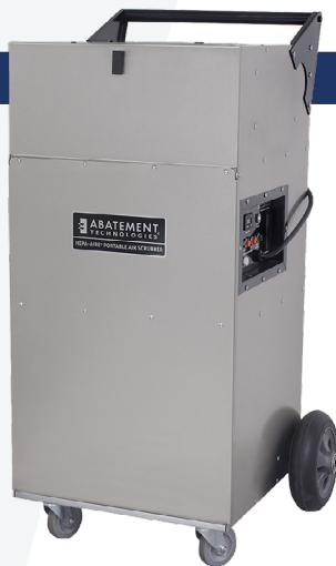
PART NO: PAS1200 / PAS1200UV