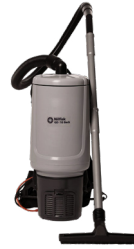
PART NO: V10