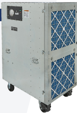
PART NO: PAS5000