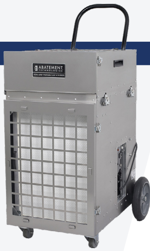
PART NO: PAS2400