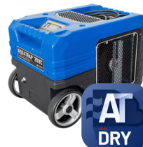
PART NO: AT200C