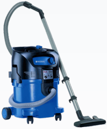
PART NO: V8000WD