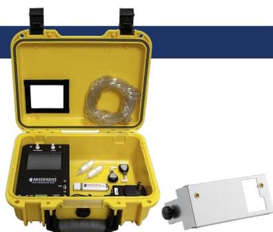
PART NO: PPM3-S

RPM-RT2T - Kit includes: 1 ea Pressure Monitor and 1 ea 25' of Clear Tubing 1/8" ID x 1/4" OD