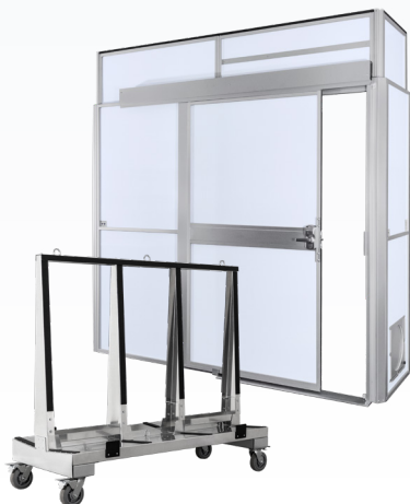
OPTIONAL TRANSPORT CART IS AVAILABLE TO PURCHASE

Our anteroom starter packages have all of the resources you need to secure construction and renovation projects in healthcare facilities. The SHIELD WALL™ by ABATEMENT TECHNOLOGIES® is a new modular temporary containment barrier system consisting of simple-to-connect panels and doors and is deployable in minutes. The system is lightweight, reusable and has a clean and professional appearance. You can quickly erect an 8'W x 2'D anteroom with these package components and then purchase additional panels, doors or accessories as and when you need them on a project by project basis. The height of every panel and door is adjustable from 7' to 10'3". Special order clear panels and mixed combinations of clear and translucent panels are available, inquire for more details.