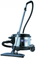
PART NO: V930