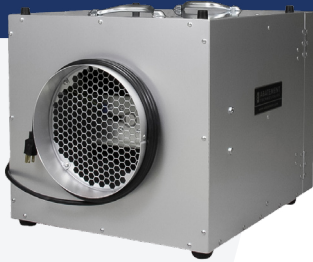
PART NO: PAS750

HEPA-AIRE® models feature tough, corrosion resistant metal cabinets fabricated using airtight and watertight “zero bypass” rivet construction.