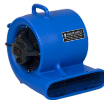
PART NO: RAM1000DBL