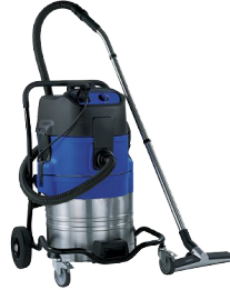
PART NO: MP3000