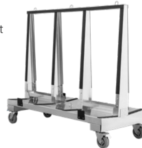
TRANSPORT CART PN: SW-CART